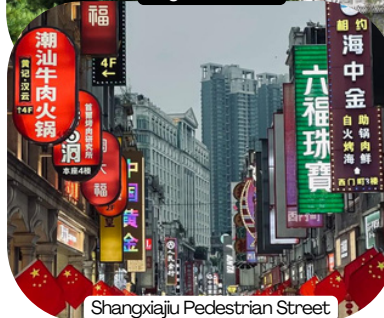
Shangxiajiu Pedestrian Street