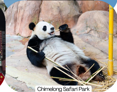
Chimelong Safari Park