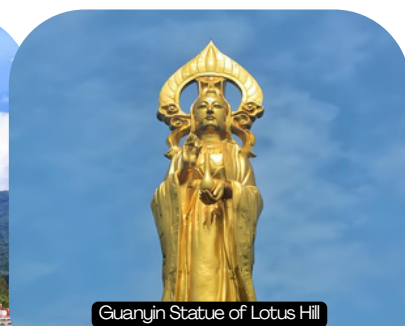
Guanyin Statue of Lotus Hill